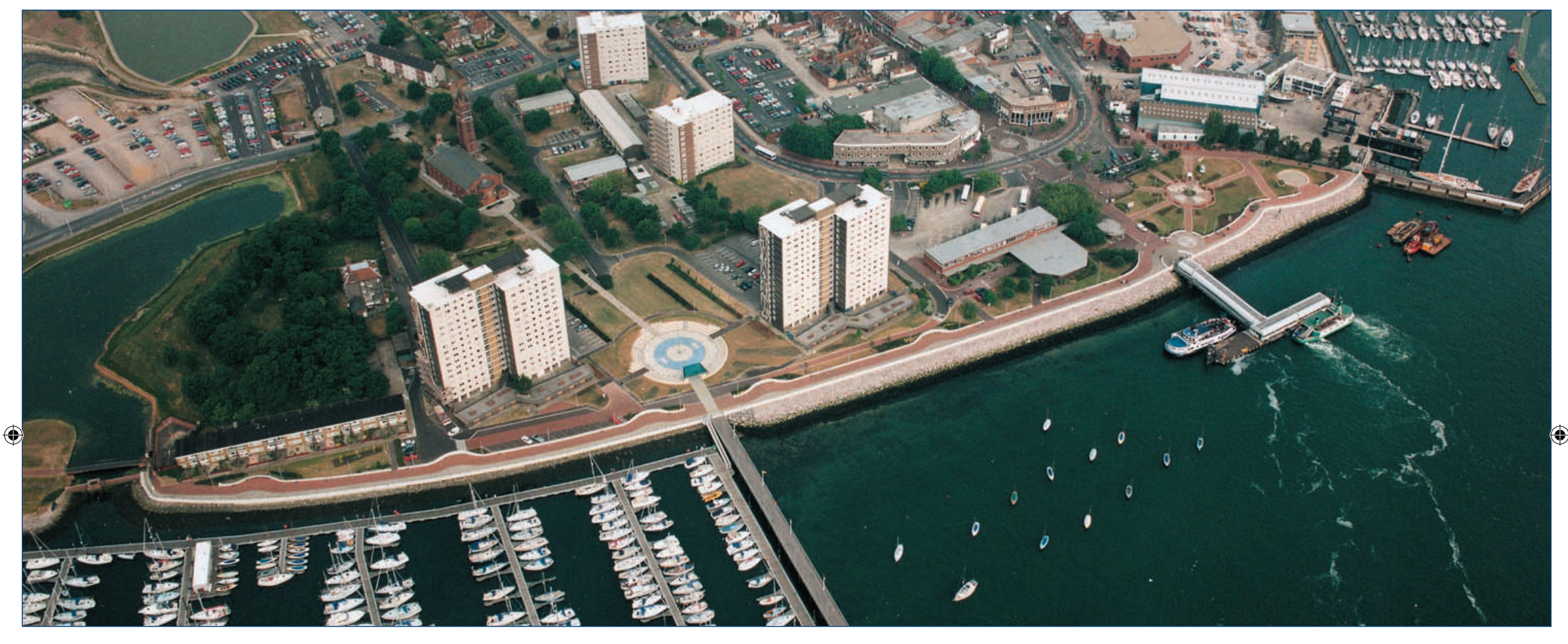
The Gosport Community Safety Partnership's Community Safety Plan - 2017/18