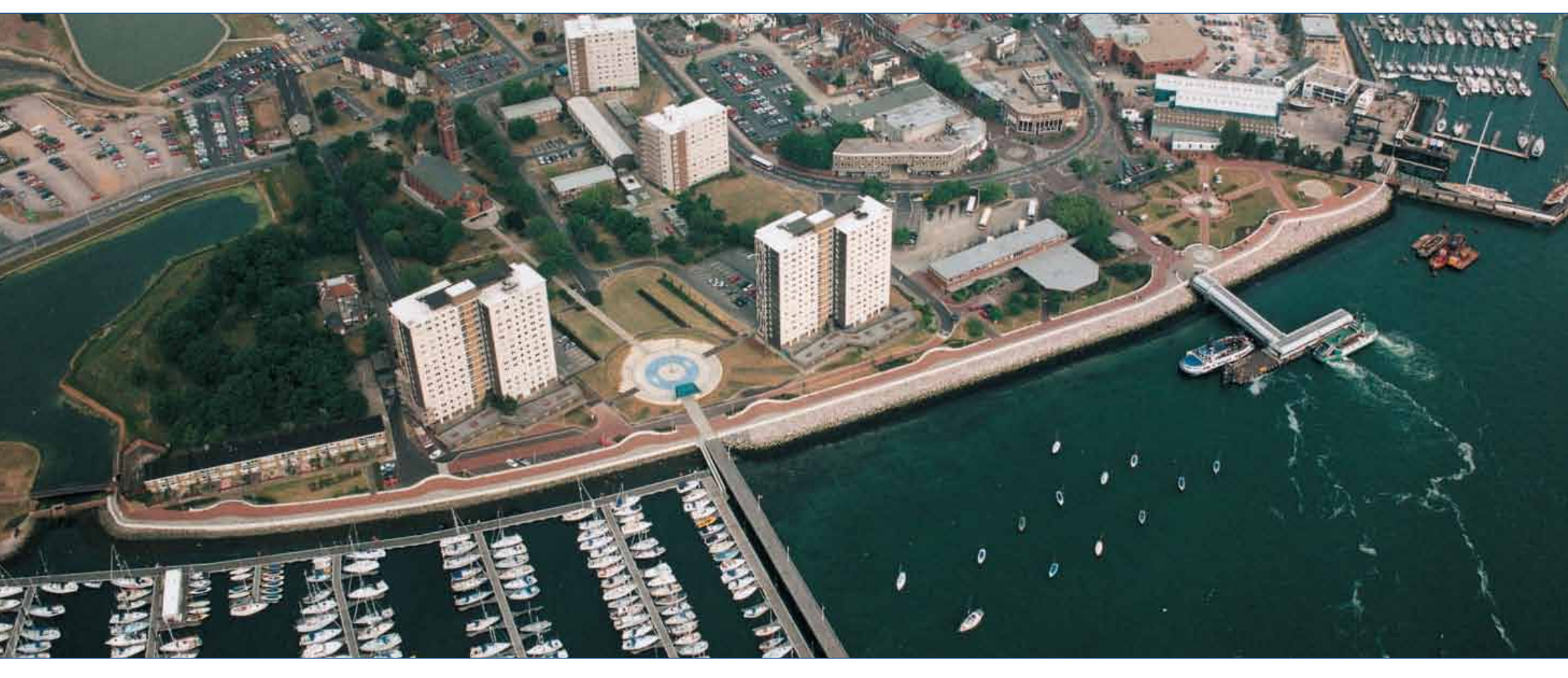
The Gosport Community Safety Partnership's Community Safety Plan - 2016/17