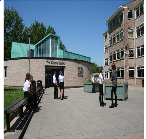
Students outside the Drama Studio

The school encourages and expects their students to be good citizens and focuses on developing respect, positive attitudes and informed choices along whilst developing social skills. Pastoral care also features high on the schools agenda.